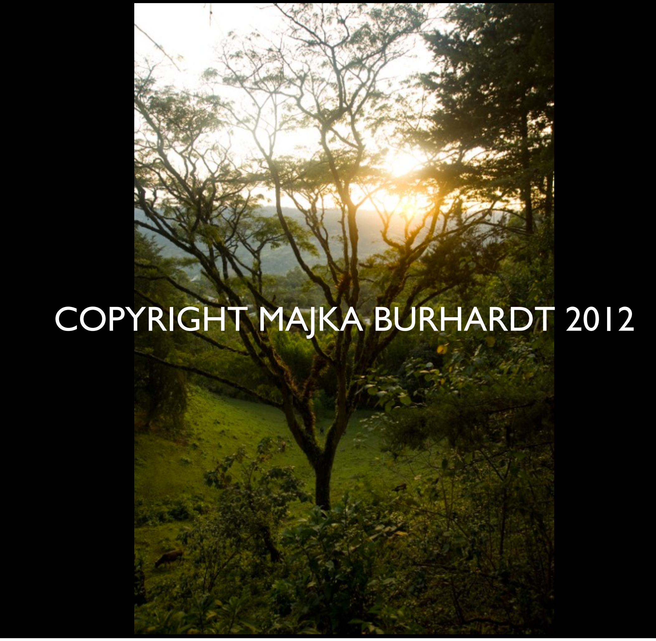
70% of the land in Ethiopia lies between 2,000 and 8,000 feet in elevation. The soil there is rich and dark and volcanic. It is the perfect place for coffee. The images we are used to seeing about Ethiopia?